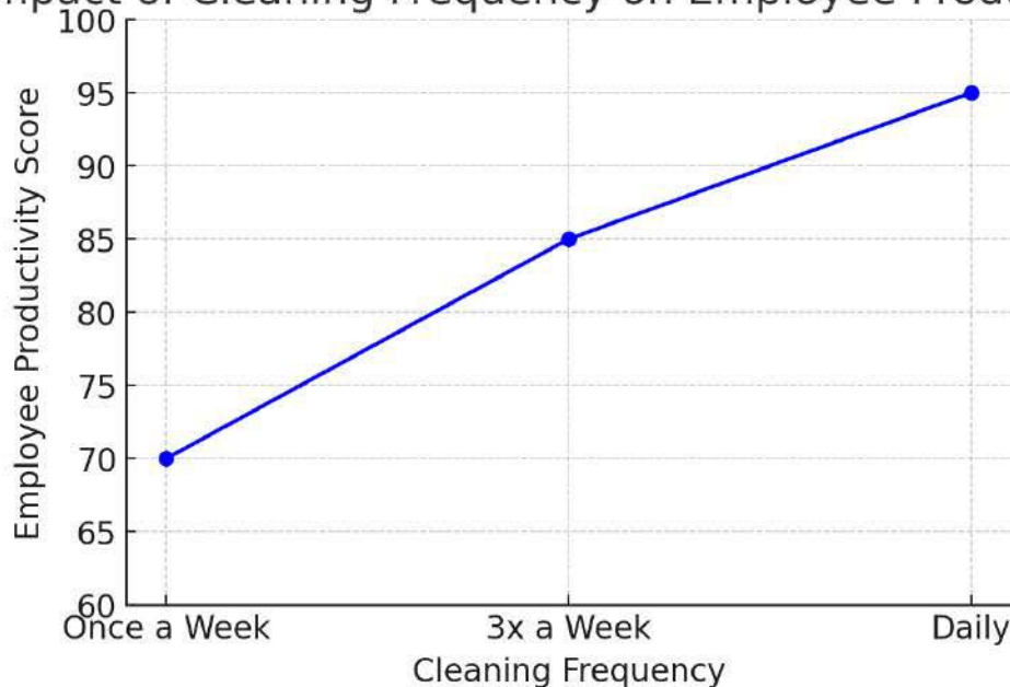
Impact of Cleaning Frequency on Employee Productivity

Shows a correlation between consistent cleaning schedules and improved employee attendance and efficiency.